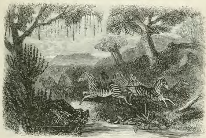
VIEW NEAR THE ZAMBESI.—TROOP OF QUAGGAS.

ripen. Saw two quaggas and two pallahs, and although I got within twenty yards of them to make sure, my caps were spoilt by the damp, and I got nothing. At night encamped on a hill, I should think about 1,000 feet above the level of the "Falls," and more than 50 miles from them. My attention was attracted by an unusual sight for this season, namely, smoke in the distance. I watched it for some moments, and finding it quite stationary, exclaimed, "Look at the Victoria Falls!" This was after sunset, and