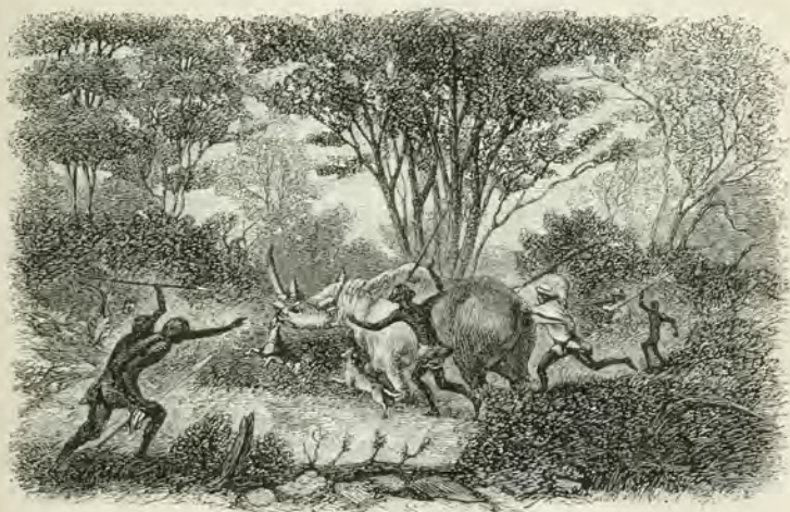
SLAYING A WHITE RHINOCEROS.