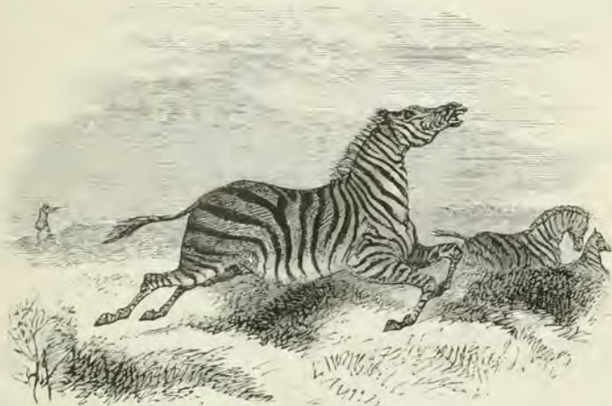
THE NEW QUAGGA.

9th November.—We halted yesterday to cut up meat, but I started again this morning. Every day is now of much importance, and I am anxious to see the men go to Baines's