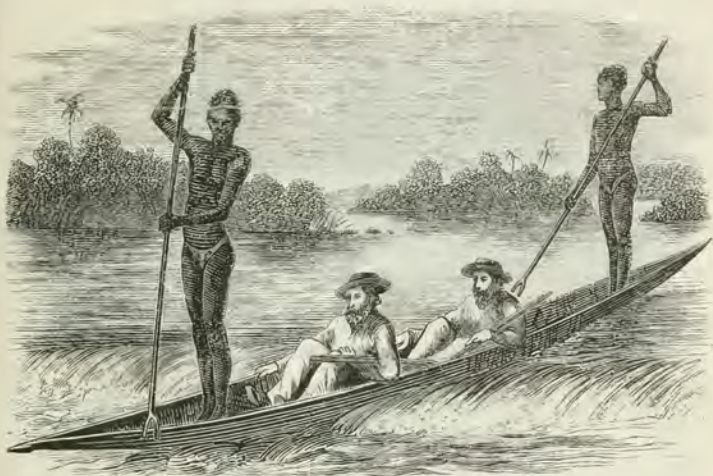
VOYAGING DOWN THE ZAMBEZI.

hurrying backwards. From the very farthest extremity of the Fall, at the east end, it comes down a sylvan valley, winding around a richly-clad mass of rock and earth, and facing a basin in which it is plain to be seen. An easy descent may be made to the eastern bank of this basin, but no farther. Beyond this, only baboons, of which we often meet a troop of several hundreds, may roam. Two large