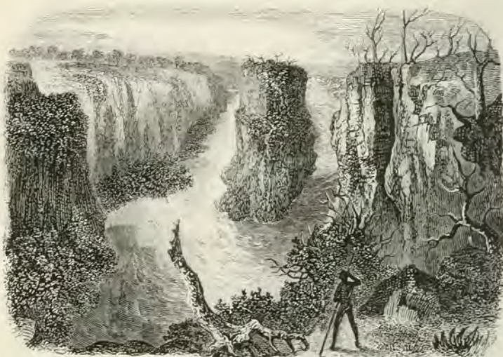
MIDDLE OF THE FALLS.