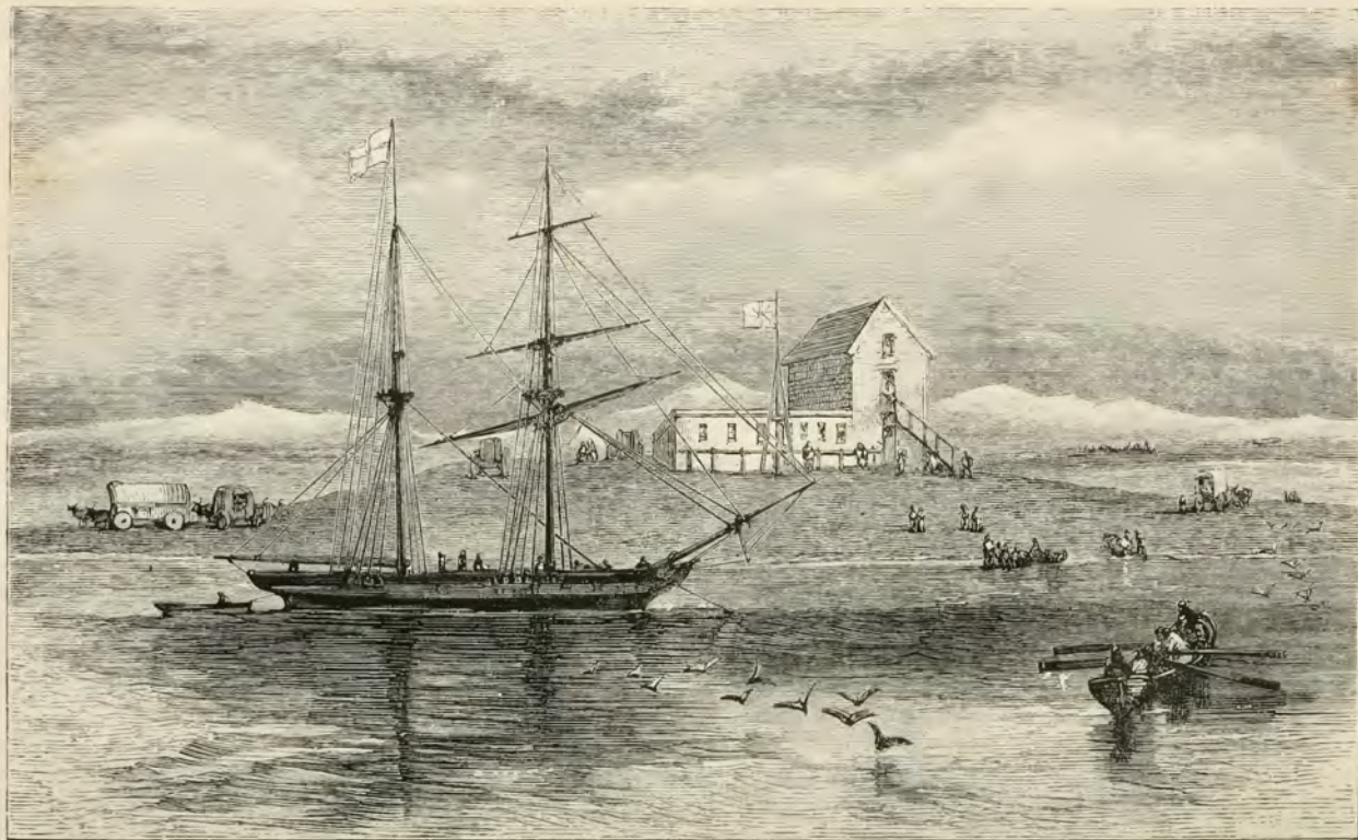
WALVISCH BAY, WITH THE SAND-HILLS IN THE DISTANCE.