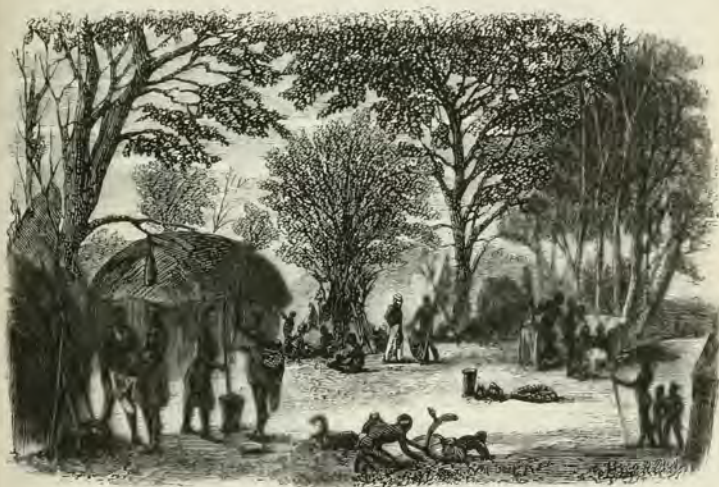
INSIDE OF MAKATO'S VILLAGE, BOTLETIE RIVER: IMPLEMENTS, &c.

1st May. —We repaired damages to wagon. I also delay to photograph. The only varnish which I have left spoils all my photographs, but I have hopes of being able to wash it off again with spirits of wine. Damaras return from my brother. I transported all my materials across the river, to take a photograph of the village and the people at work. There was a fine display of tools, implements, &c., hoes, spades, hammers,