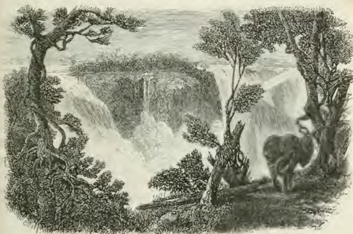
THE VICTORIA WATERFALL FROM THE WEST END, WITH THE LEAPING WATER IN THE FOREGROUND.

but as the boisterous laughter and merry frolicking of our little Makalakas subsided, there gradually arose in the air a murmuring, and at length a roaring sound, increasing as the night advanced, and sounding like the dashing of a mighty surf upon a rock-bound coast. So much does the sound resemble this, that a stranger, unacquainted with the existence of a waterfall here, and unaware of his distance from the sea, could not be persuaded to the contrary. It was one everlasting roar, broken occasionally by the thundering, like