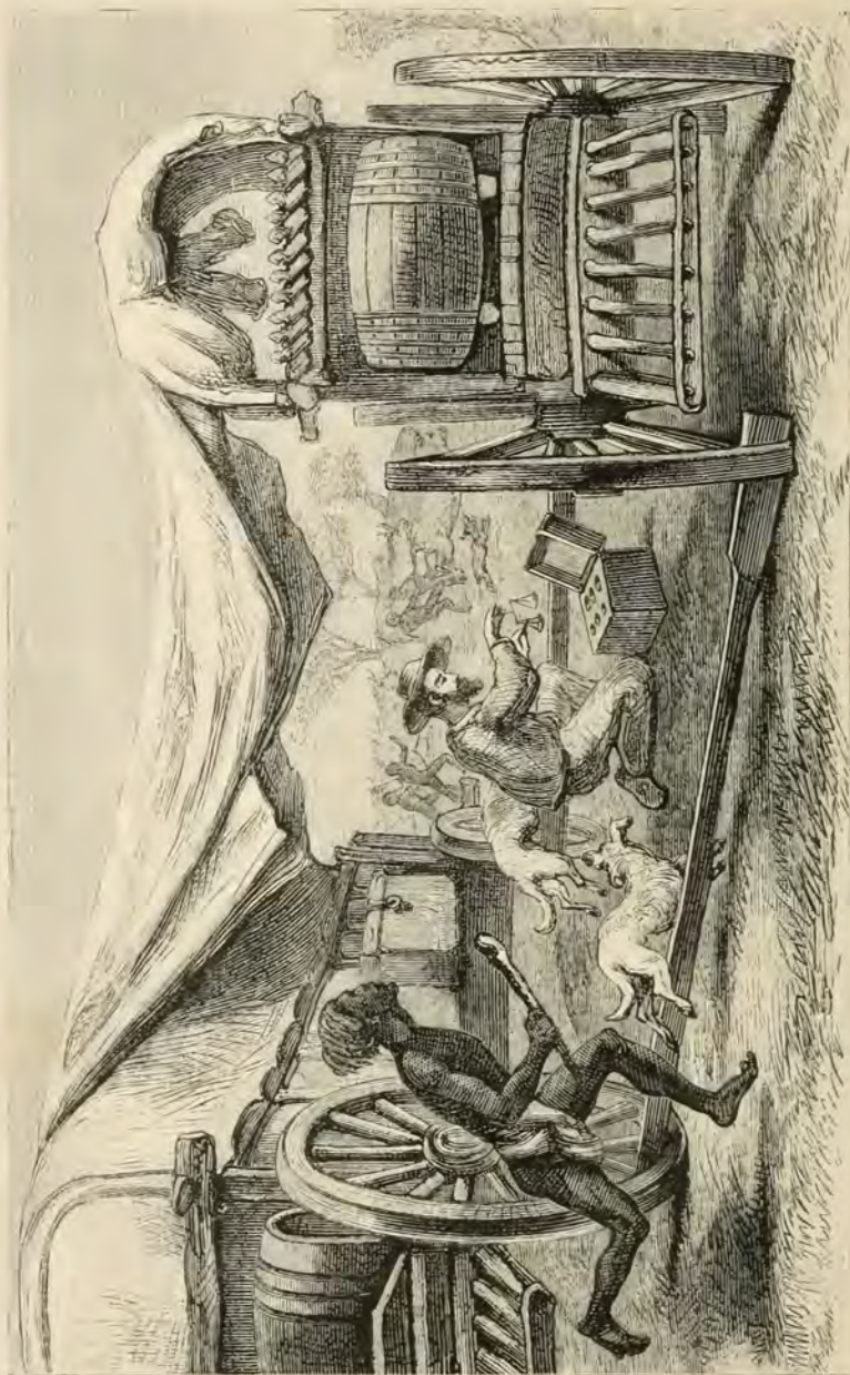
PHOTOGRAPHY UNDER DIFFICULTIES.