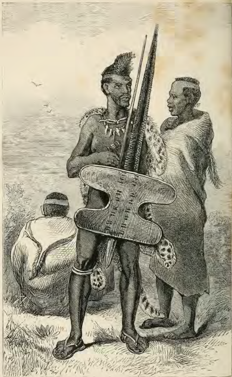
A BECHUANA WARRIOR.