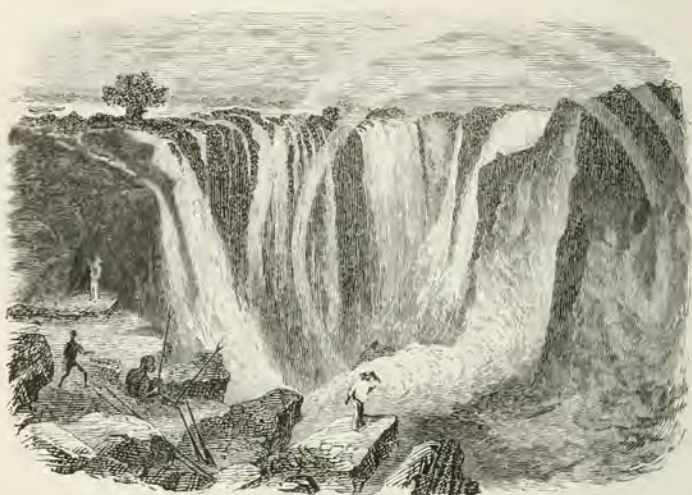
VIEW LOOKING EAST FROM THE GARDEN ISLAND, IN THE MIDDLE OF THE FALLS.

although only one view is visible, it is a very grand and imposing one, almost more so than any other. A large mass of rock, having at some time or another fallen, has broken away an angle on the east side of the island, which has so far widened the crack that one gets a very clear and tolerably comprehensive sight of one of the largest bodies of water, falling to the very bottom, although the distance is rather foreshortened; also a very good perspective of the