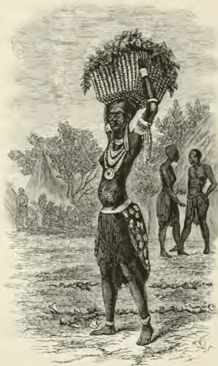
ONE OF WANKIE'S WIVES.

The weather is now so frightfully hot and debilitating that where I could formerly walk 20 miles a day with comfort, I now can scarcely do 12, and having, moreover, blistered