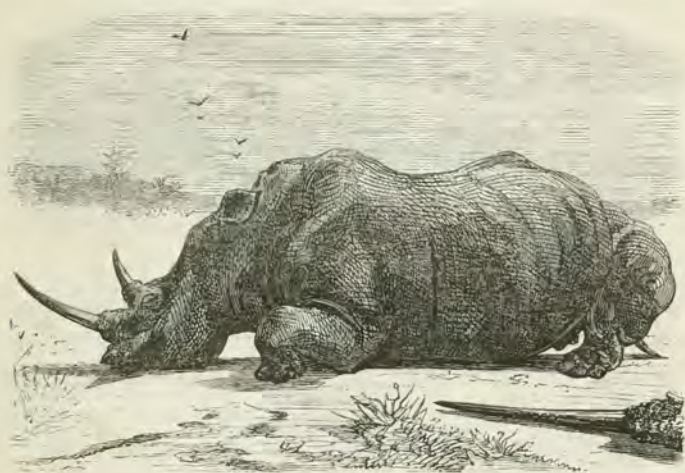
RHINOCEROS MOROGOU, AND HORN OF THE SUPPOSED KOBABOA.

(? hench bone) is as high or higher than the withers; has a large square hump, a double navel, and females a blind pouch near the vagina. It moves each ear alternately backwards and forwards when excited, and which, when thrown forward, turns as if on a pivot, so bringing the orifice of the ear innermost. It has a broad square muzzle, eyes small and lateral, horns long (anterior one white), and of a coarse fibre. It is an indolent creature, and becomes exceedingly fat by grass eating. The mohogu is also gregarious in families, which are